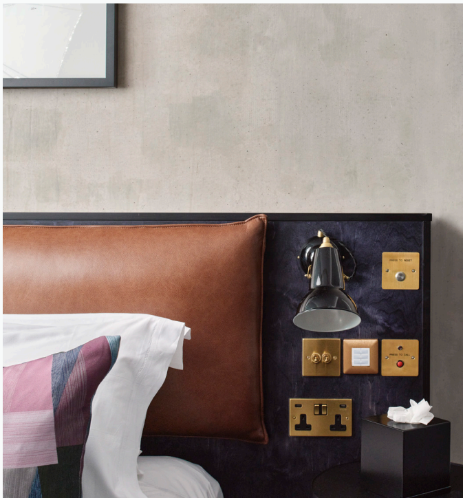
Electric curtain controls and switches