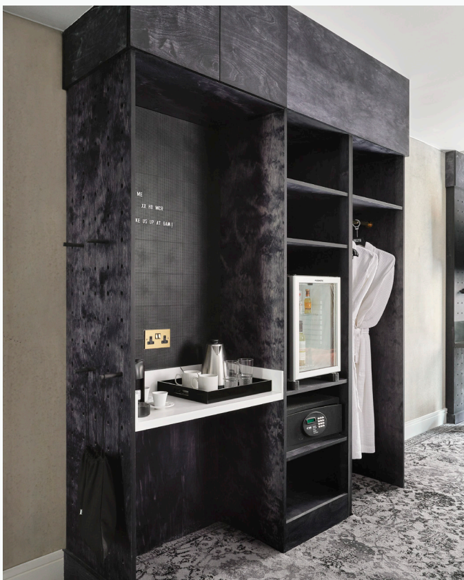
Accessible bedroom furniture including desk, safe, mini-bar, and adjustable wardrobe

Robin Sheppard, President, Bespoke Hotels