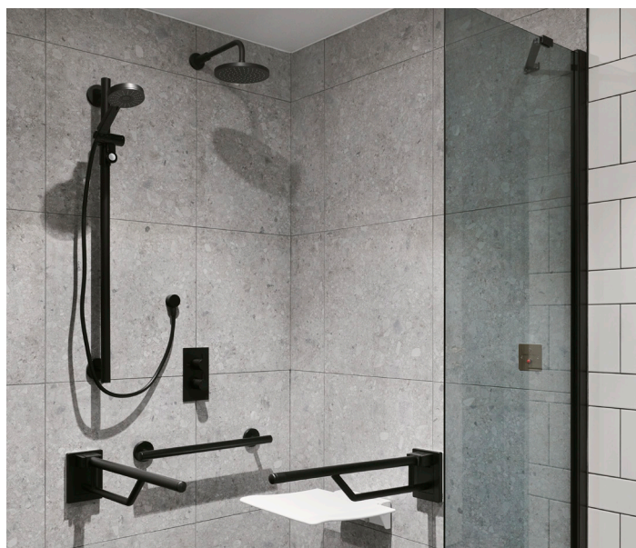
Removable grab rails and shower seat

Making the disabled guest experience as independent and inclusive as possible was central to owner, Bespoke Hotels', ambition for Hotel Brooklyn. To realise this vision, the UK's largest independent hotel group engaged inclusive design specialists, Motionspot, to design and supply Hotel Brooklyn's 18 accessible suites and build in attractive access principles and features throughout the hotel's communal areas which include conference rooms, a restaurant, bar, and mini cinema.