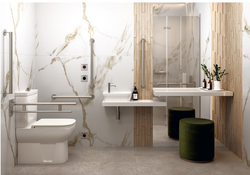
A Motionspot Doc M pack

Discuss your business' requirements with Motionspot's access and inclusion experts by emailing team@motionspot.co.uk or calling 020 3735 5139.