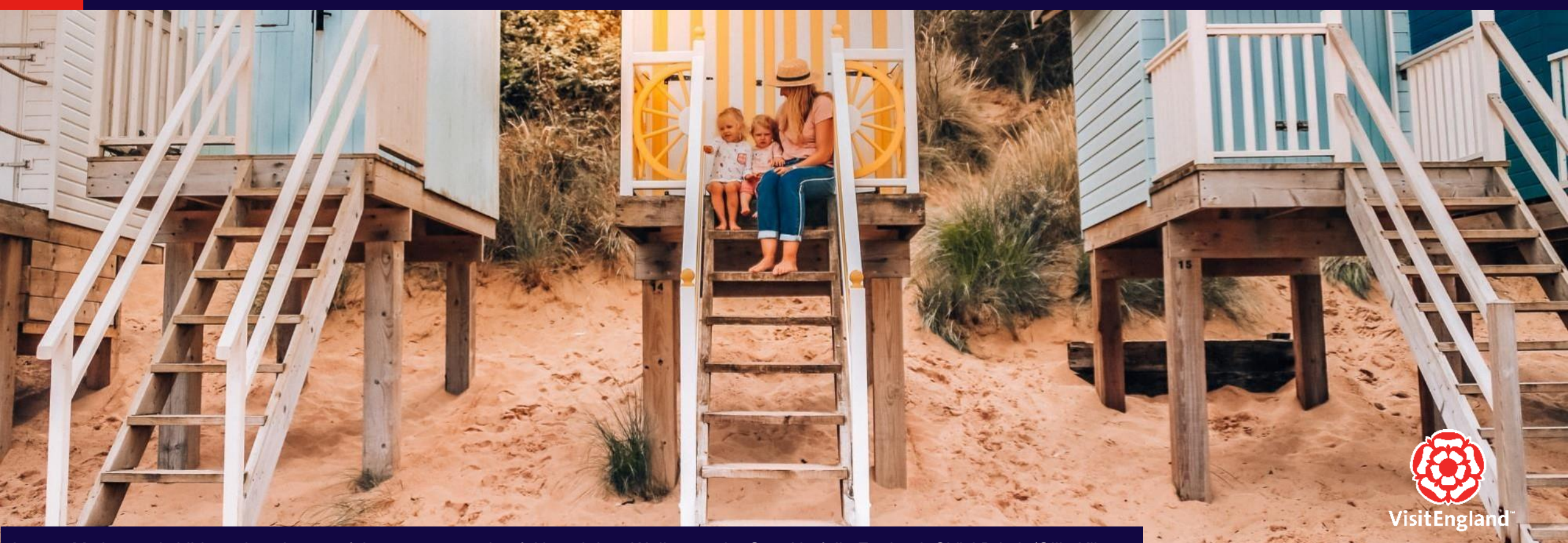
Image: Mother and children sit at the top of the steps at a colourful beach hut. Wells next the Sea, Norfolk, England.