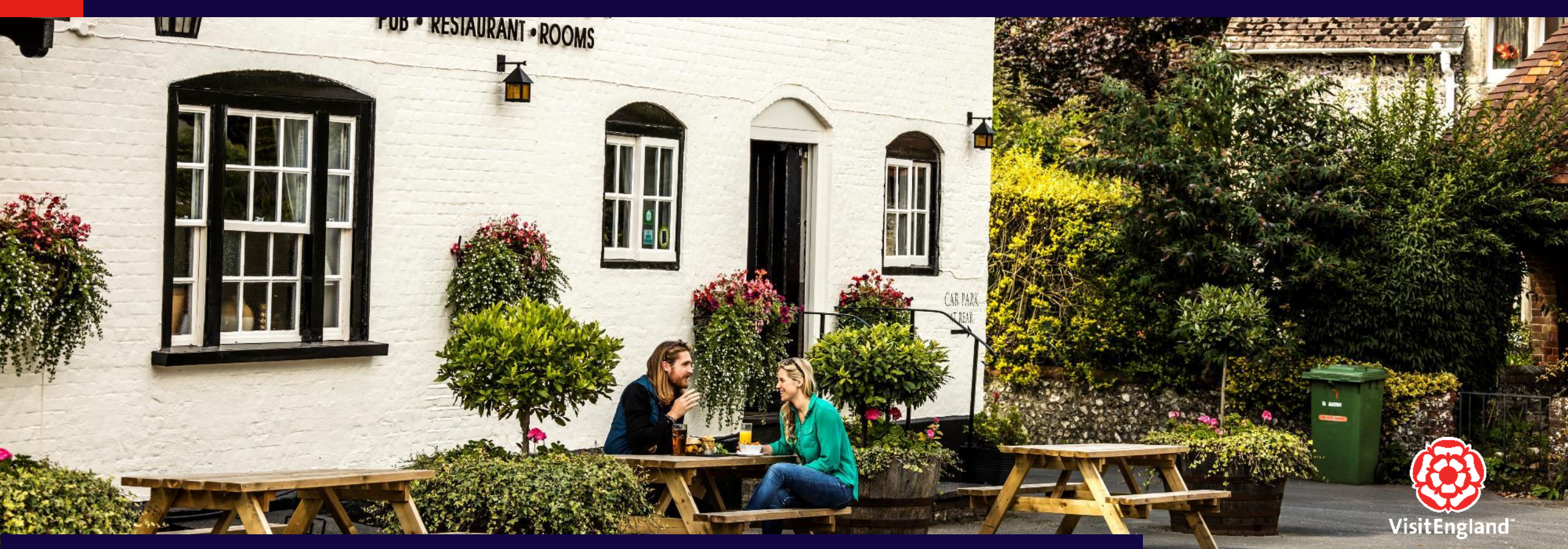
Image: A couple sitting outside the pub on a bench having a drink. Perthshire, Scotland.

Alternative data, sample sizes and definitions